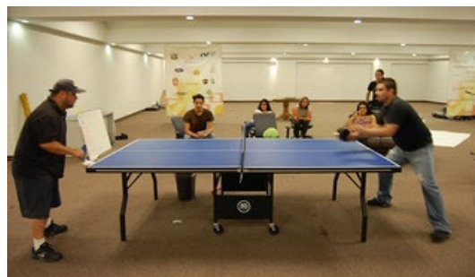
Table Tennis increases concentration and alertness, stimulates brain function, helps develop tactical thinking skills, hand/eye coordination, and is good exercise! The Sport is important in combatting neuro-cognitive decline and promotes mental well-being.