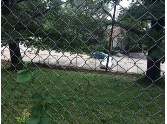
Route of water along Library Parking area