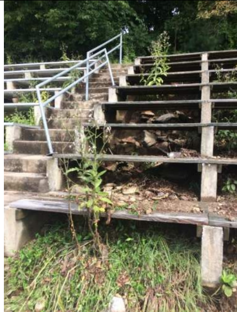
Wash out at home bleacher