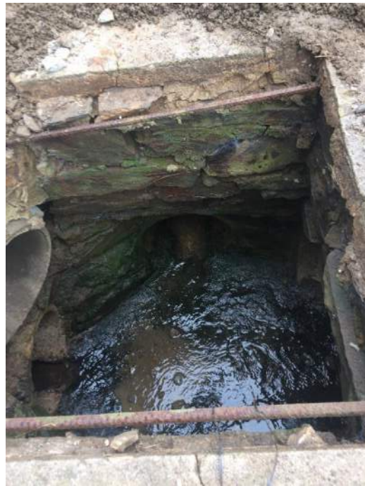
Uncharted pipe and structures