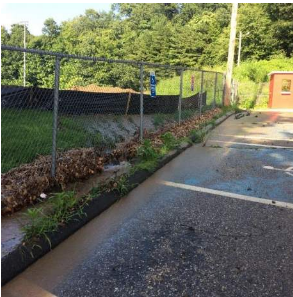
Run off at library parking areas