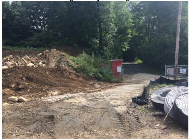
Repairs at South Construction Entrance.