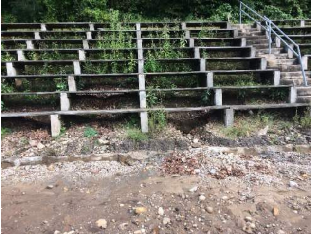
Wash Outs at home bleachers.