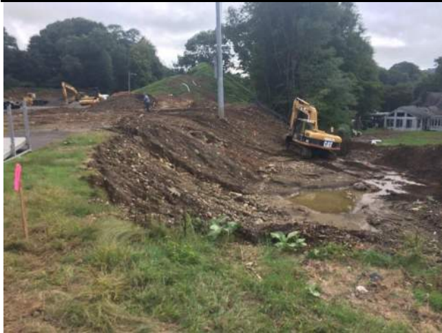
Adjacent Property (note deposits bottom of slope)