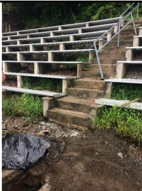
Uncharted pipe and structures