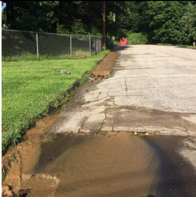
Run off at library parking areas