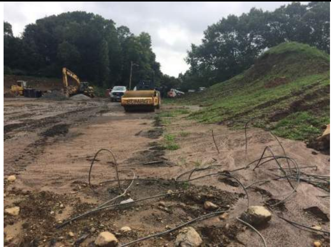
Sloughing of stockpile areas