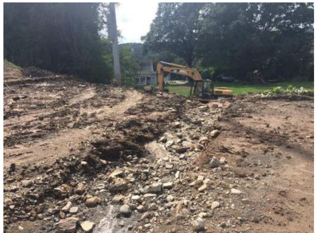
Erosion Gully West at V. Bleachers