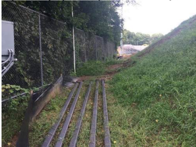
Slough at west of Stockpile (note buried silt fence)