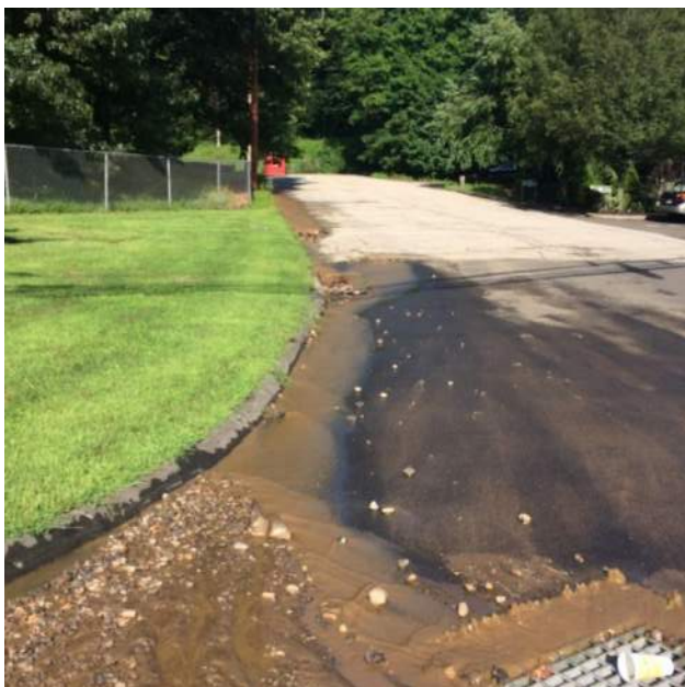
Run off at library parking areas