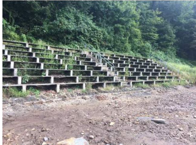
Wash Outs at home bleachers.