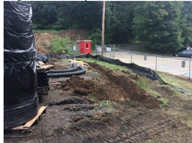
Repairs at South of Track